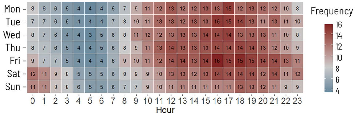
Fig. 3. 2019 health-related public calls for police service, citywide average per hour, Philadelphia, PA